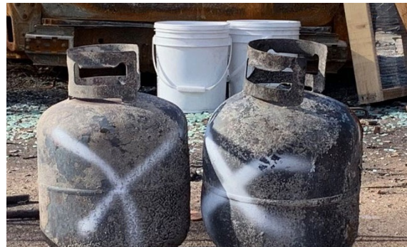
Empty containers EPA inspects will be marked with a white X, made safe, and left to be removed during Phase 2.