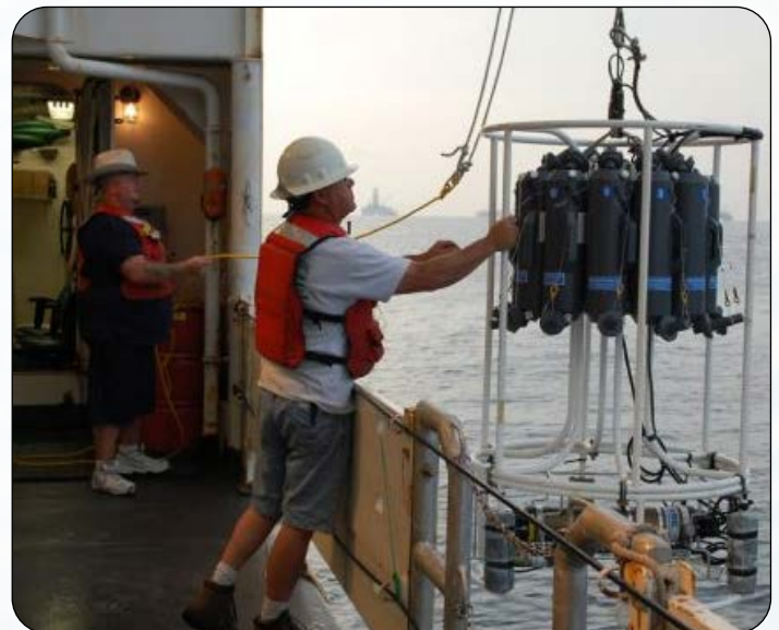
Figure 2: CTD rosette illustrating sampling bottles (top of structure) and submersible sensors (bottom of structure).