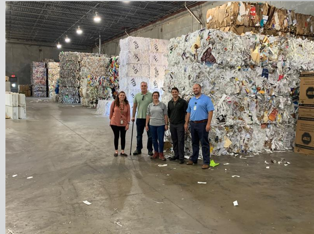
Choctaw Nation Recycling Facility June 2022