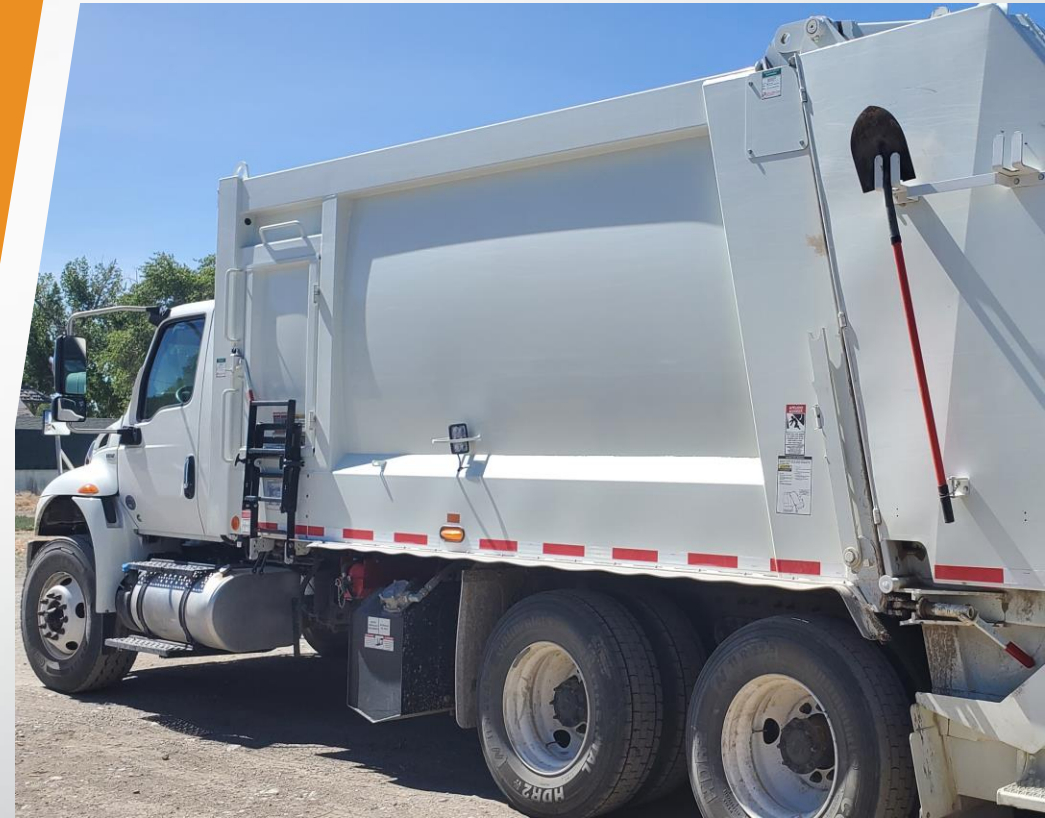
Walker River Paiute Tribe May 2022