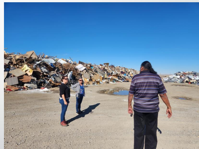
Blackfeet Nation transfer station October 2022