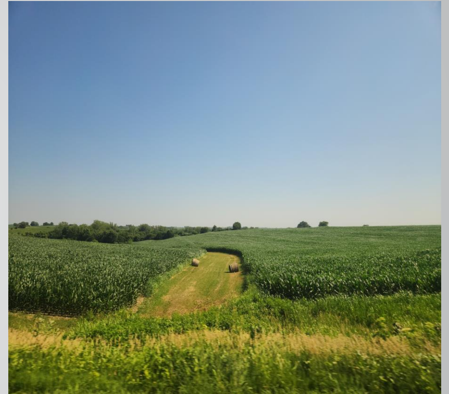
View from Iowa Tribe of Kansas and Nebraska Office June 2023