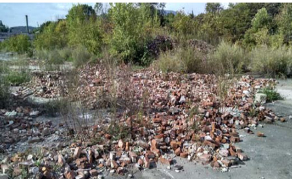
Bricks and debris at the Goodyear Site

“That was a great project because it enabled us to use our revolving loan fund to promote both environmental and economic sustainability. As the loan is paid back over time from this solar energy project, it will help us fund other cleanups in the future.”