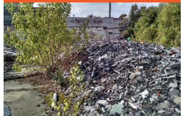
Debris at the Goodyear Site

Former Uses: Agriculture, Machine Tooling, Manufacturing, Light Commercial, and Industrial Space