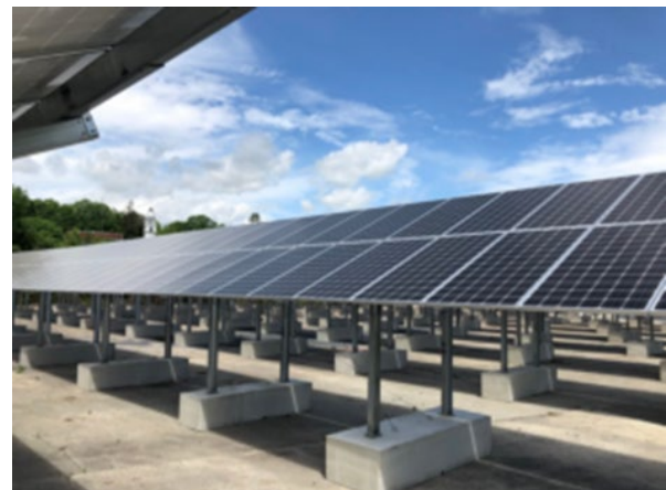
Finished solar panel installation

Due to the site's location in a designated flood plain, long-term redevelopment options were limited. One of the primary options that local planners settled on was to use the building slab for a solar array. The site had significant sun exposure that would make for an ideal location. The basic concept was to have local businesses in turn purchase the renewable energy to power their facilities. As community support for this idea grew, a local public/private partnership formed to shape this into a reality.