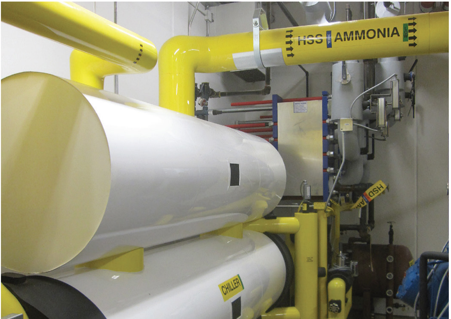
A chiller in an ammonia refrigeration system.