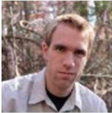
Kevin Leary, U.S. Department of Transportation