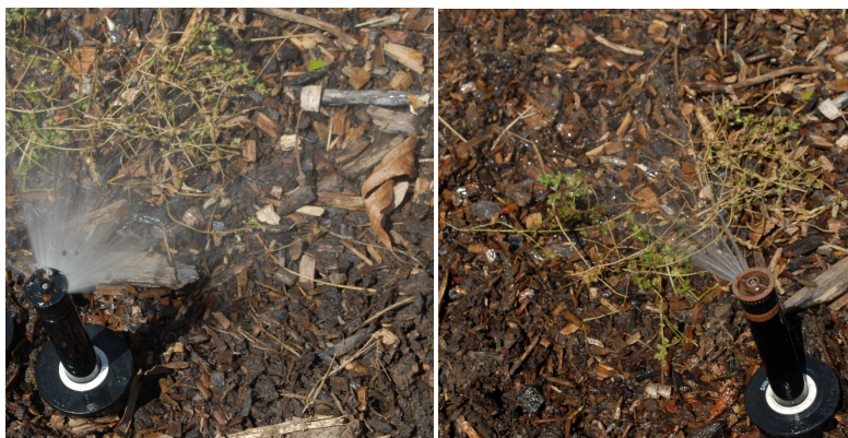
The image at left shows a spray sprinkler with a body that is non-pressure-compensating, resulting in water wasted from misting and overwatering. The image at right shows a pressure-regulating spray sprinkler body that regulates the water pressure to the sprinkler nozzle's optimal pressure.