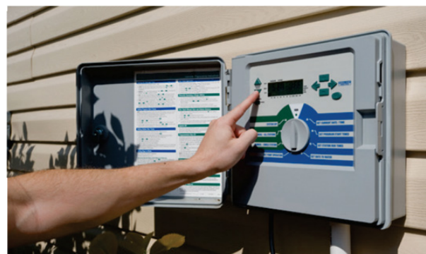
WaterSense labeled irrigation controller