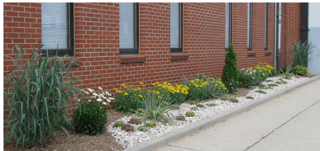
Avoided strip grass.