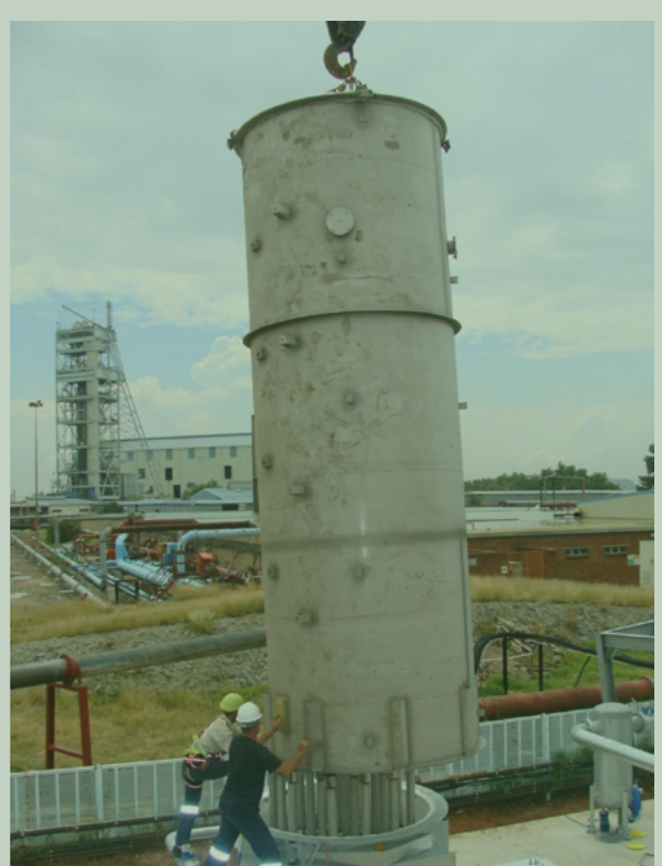
Commissioning of Flare at Beatrix Gold Mine