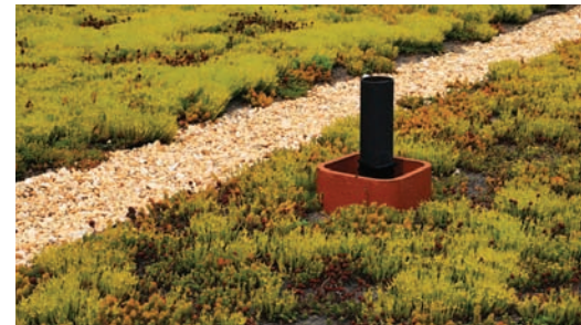
Rain barrels, pervious pavers, and vegetated areas designed to retain stormwater are all components of green infrastructure.