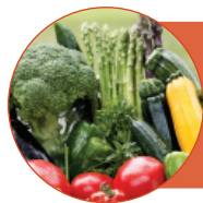
Vegetable Trimmings Base for soups, sauces and stocks

As long as proper food safety and handling practices are followed, reusing leftover food can save money and reduce waste. Creatively repurpose leftovers and trimmings to efficiently use excess food for other meals. Flexibility in menu planning to accommodate the use of excess food from previous meals is key to success.