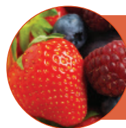
Leftover Fruit Smoothies or dessert topping