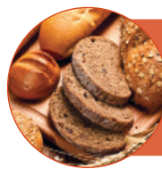
Day-old Bread Croutons or breadcrumbs